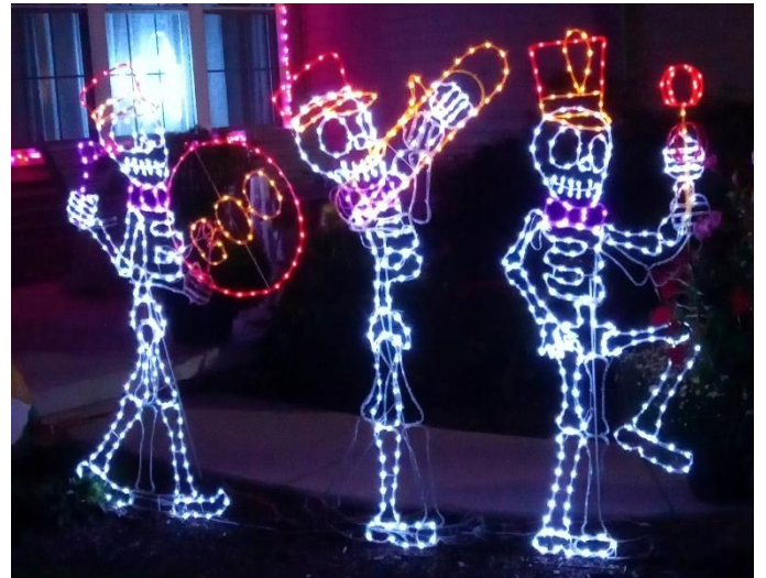
The Skeleton Marching Band on Princeton.

Building Reps: Plan to attend the next rep meeting on NOVEMBER 12th at 7 PM